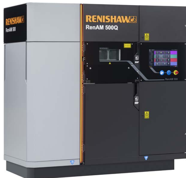
RenAM 500Q multi-laser AM system

The RenAM 500Q features four high-power 500 W lasers, which can address the entire build plate. The machine also comes with automated powder and waste handling systems that enable consistent process quality. Renishaw's system fits comfortably with BIG-nano's requirements, allowing engineers to both minimise build time and ensure consistent part quality.