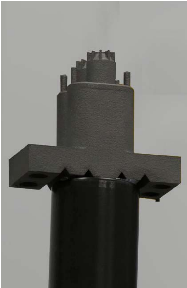
3D printed nozzle